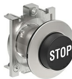
Pushbutton actuators, spring return, with symbol LPFB21